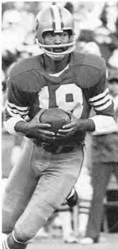
GENE WASHINGTON, above, generally recognized as one of the premier wide receivers in the NFL, is in his seventh season as a San Francisco 49er with a career total of 262 receptions for 4,834 yards (an average of 18.5 yds. per catch) and 39 TDs.